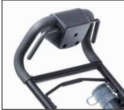
Quick-Stop as standard